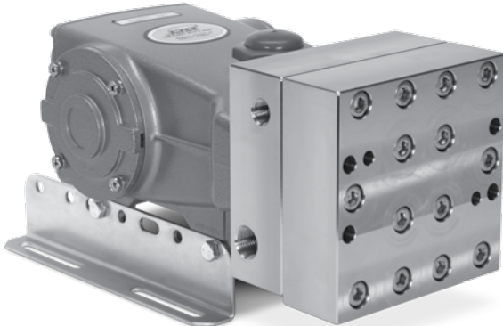
Model 781 Shown (Mounting rails sold separately)